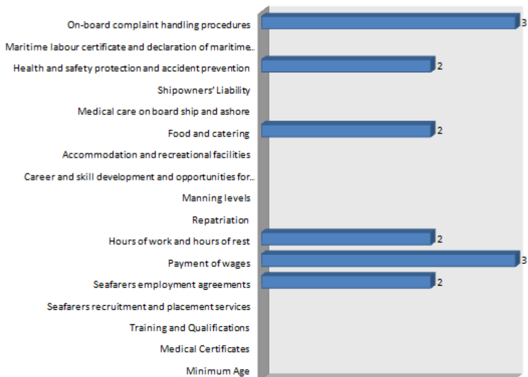
Figure 1: Deficiency categories percentage (%)